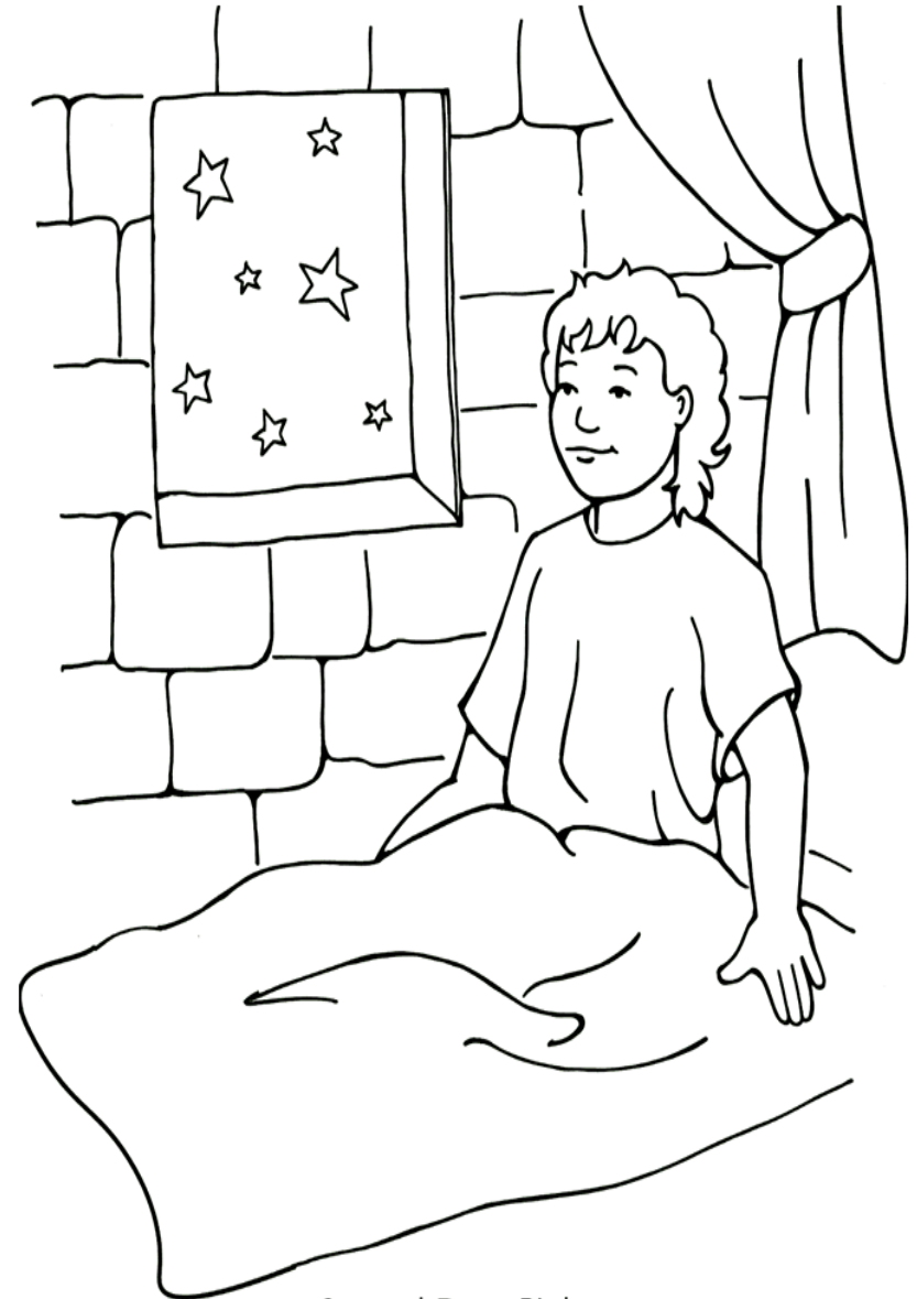
Samuel Does Right 1 Samuel 2-4, 7