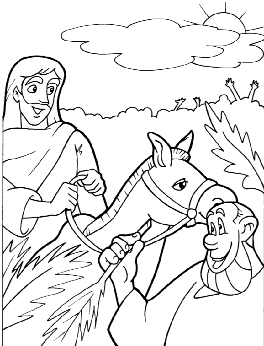
The Triumphal Entry